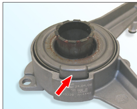
Fig. 2: Wrong

Note the specifications of the vehicle manufacturer!