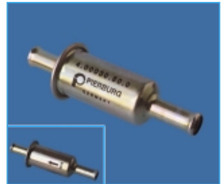
Product view 4.00030.80.0

The replacement intervals for the pre-filter are the same as for the fuel filter.